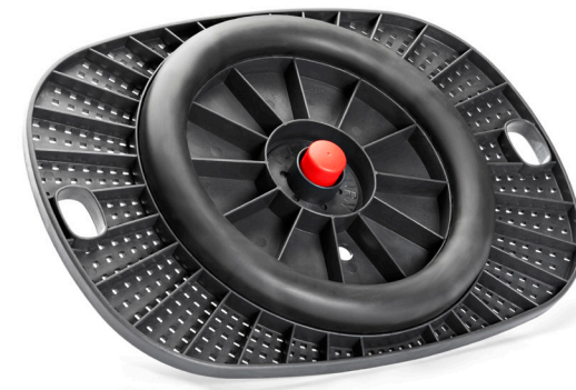
Backapp 360, Dark Grey 8000-7021